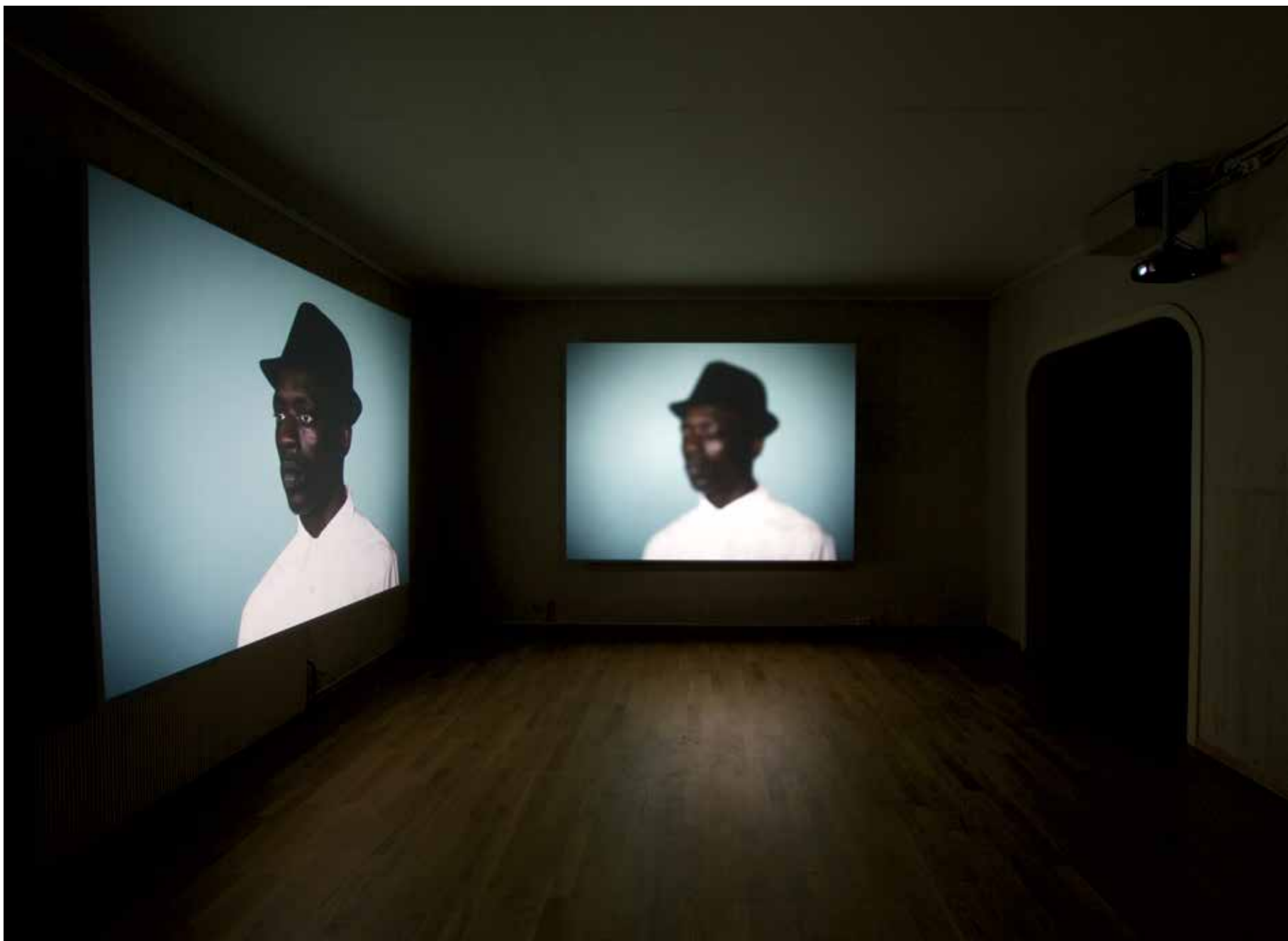
Installation view of Untitled (Structures) , 2012, by Leslie Hewitt and Bradford Young, at Norway's Loffen International Art Festival in 2013.